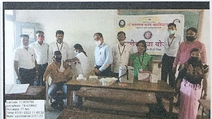
A glimpse from vaccination drive organized by NSS unit of college.